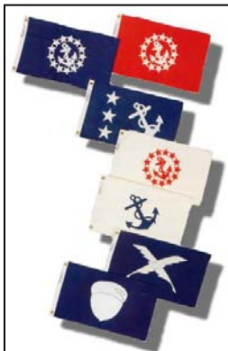
Yacht Club Officer's Flags of Office

The Annual Member's Meeting which will be held Tuesday, October 7 at 7pm, is a yearly event at which the officers and board for the following